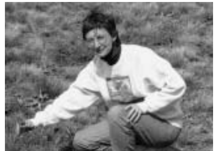
Range ecologist and wildlife advocate Joy Belsky passed away this December.

Belsky published more than 45 peer-reviewed papers and book chapters on African and North American grasslands.