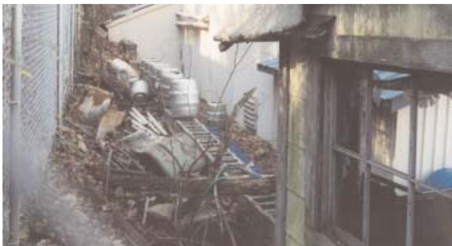
Inside the chain link fence at the Tull Chemical Plant