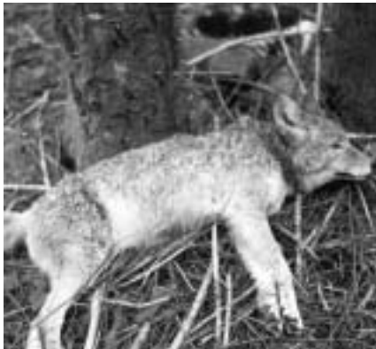
Coyote killed by neck snare.

Maine Standoff Over Coyote Snaring Continues For years, Maine has had one of the nation's most liberal policies on coyote hunting: the animals may be hunted year round, including the use of snares for part of the year. While opponents are calling for a ban on the cruel and unnecessary practice, state wildlife officials are trying to expand the program. Snaring often fails to kill the coyote immediately, causing undue suffering, and fails to affect overall coyote populations. Hunting groups claim the program helps maintain deer populations, but a memo from a state biologist notes that the program takes away crucial resources for habitat protection and management.