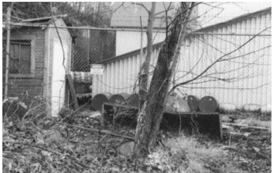
The Tull Chemical factory of Oxford, Alabama produces 1080, one of the deadliest poisons on Earth.

All-too-often, we in the so-called environmental movement try to find new ways to divide "us" from "them." But, as this case illustrates, seemingly-disparate issues are closely connected. There's no them. It's all us. And we will be doing all we can to help the neighbors of Oxford, Alabama. ■ For more on this issue, please read our story on page 4.