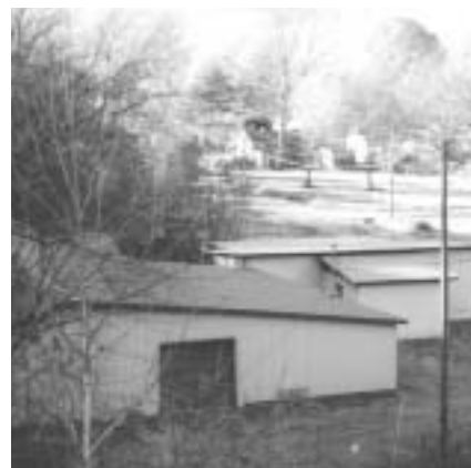
Tull Chemical, the only U.S. company that manufactures and exports one of the deadliest poisons on Earth was surprisingly unassuming. And surprisingly close to residents: homes and a school bus can be seen in the background.