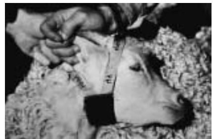
Lamb fitted with 1080 collar.

Wildlife Services, a division of the USDA, supports and encourages the use of 1080-filled LPC's by ranchers, at taxpayers' expense. The effectiveness of the collars for ranchers is minimal, with 20 coyotes killed in the year 2000. And, because of coyote breeding patterns, the deaths have little effect on overall coyote populations. Currently, nine states use the LPC: MT, OR, VA, NM, SD, TX, UT, WV and WY. ■