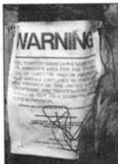
One of the two signs that were not in plain view to warn the public.