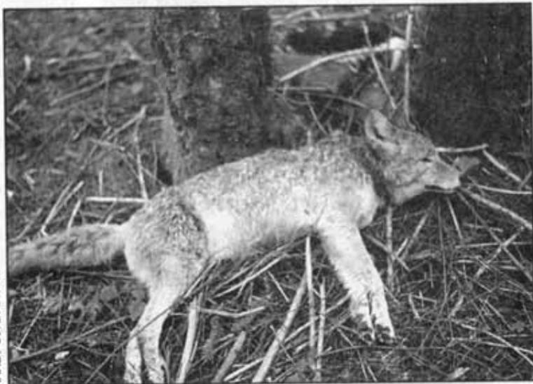
Strangled in neck snare, this coyote was one of many drawn to a heap of rotting wild animal carcasses purposely placed by Wildlife Services. Pets were also imperiled by their attraction to the area.