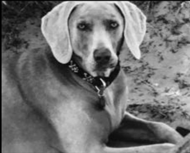
MOLLY in Wyoming