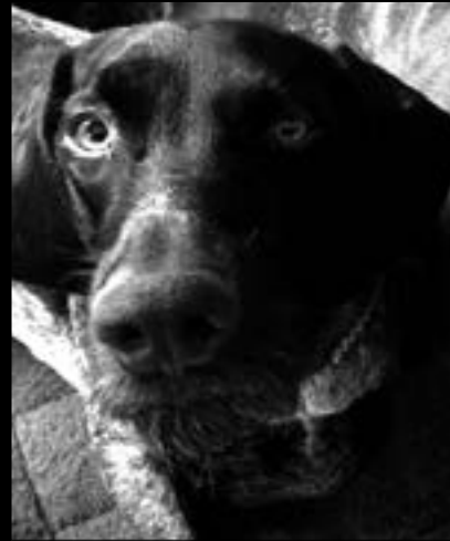
ABBY in Wyoming