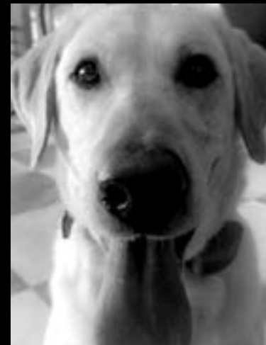
KASEY in Idaho